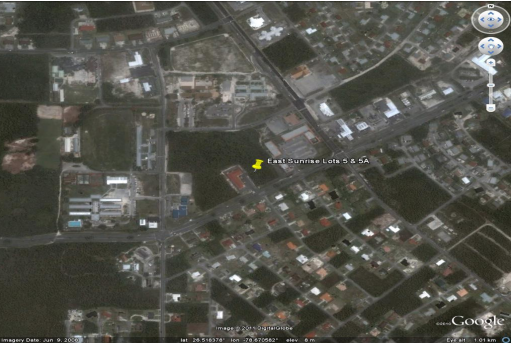
An excellent commercial investment, in a prime location in Grand Bahama. A great location for a sho

This commercial property is in an excellent location of East Sunrise Highway. This property is situated directly next to Kentucky Fried Chicken, a great growing location....read more on our website.