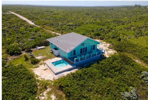
Single Family Home in Long Island

The main feature of this spectacular home is its direct beachfront location. With miles of uninterrupted sandy beaches stretching in both directions, you'll have your own private slice of paradise to explore. One of the highlights of this beachfront retreat is the inviting swimming pool, positioned to offer stunning ocean views. Whether you're taking a refreshening dip in the pool or lounging on the deck with a cool drink in hand, you'll have the ocean as your backup. The home's elevated design not only provides panoramic views of the beach and ocean but also ensures privacy. Inside the residence, the open-concept living areas are thoughtfully designed to maximize ocean views from every angle. High ceilings and sliding glass doors blur the line between indoor and outdoor living, allowing y...read more on our website.