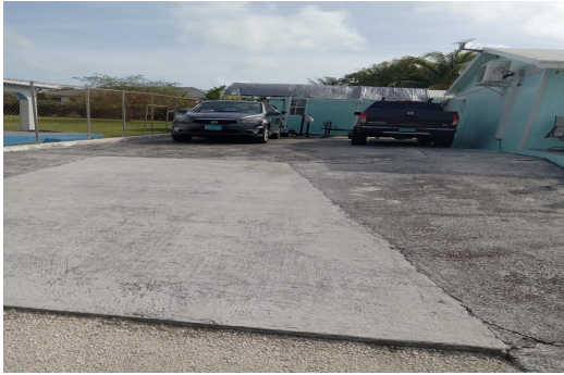
Single Family Home in Eleuthera

This turnkey property consists of a quaint 3 bed, 2 bath home and a 1 bed, 1 bath cottage, with property size of 14,000 sq. ft. The buildings are of concrete block construction with a combination cement slab and asphalt shingle roof. It is fully furnished with all new appliances and air conditioning throughout. Windows are hurricane impact. It is located on Guy Pinder Road in a quiet neighborhood, in short walking distance to the beach and park. The buildings are set back approx. 90 ft. from the road with a large front yard, with lots of room for expansion or additional cottages. An ideal residential or investment property!...read more on our website.