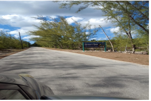
Lots/Acreage in Cat Island

55 acres of commercial property located in Dumfries, North Cat Island is ready for development and is ideal for a bonefish lodge or small resort. Great investment property on the beautiful Cat Island that is in a tranquil, relaxing environment where one can retreat and get rejuvenated. The property is situated near several bed and breakfast, small resorts and numerous second home residences....read more on our website.