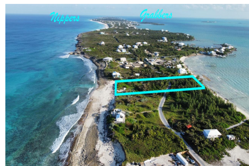
Lots/Acreage in Abaco

"Sand Castle" is the definition of "Sea to Sea" and boasts just over 3 and 1/2 acres. This gives an investor the best of both worlds with views of the Atlantic ocean on one side and a beautiful beach setting on the Abaco Bay side where a dock can be built for the boating enthusiast. "Sand Castle is only one minute from the gates of Bakers Bay. This building envelope would provide a perfect setting to build a beautiful estate stretching form the ocean to the bay or chose your favorite side. This can also be a great development opportunity with many options that could be considered given the size and unique nature of its layout!...read more on our website.