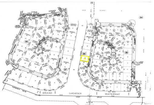
Affordable Property Near The Grand Lucayan Water Way

Affordable waterfront property located in Windsor Bay on Notley Drive. Zoned Single Family and priced to sell!! Call us today....read more on our website