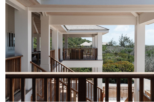
Single Family Home in Exuma & Exuma Cays

This amazing, brand new 8,500 sq.ft. home was meticulously designed and built to enjoy all of the elements the island has to offer, with unobstructed views of the beach and the clear blues of the creek and bayside. The home has a stylish island-inspired design that includes an open plan living room, expansive dining room with seating for twelve, a Michelin chef's kitchen with a breathtaking island all under the cathedral vaulted Cypress ceiling. The home was designed for creating memories, enjoying meals together, entertaining family and friends and relaxing after a day in the sun. With more than 3,500 square feet of hand oiled teak deck surrounding the home, Casa Carisma offers three separate outdoor areas for one to enjoy. An al fresco dining table just off the kitchen that seats up to…read more on our website.