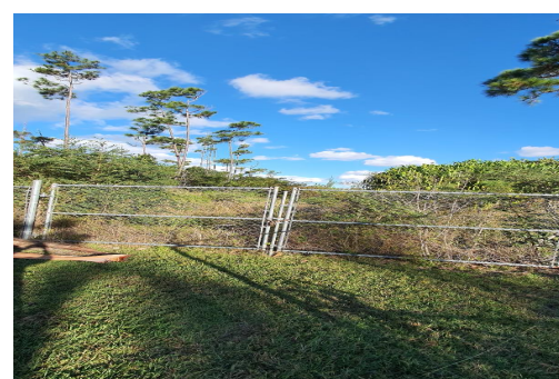
Lots/Acreage in New Providence/Paradise Island

A unique opportunity to purchase a vast expanse of undeveloped property in the luxurious gated community of Lyford Cay. Lyford Cay boasts an IBC school, port of entry mega-yacht marina, an ultra exclusive members club, golf, tennis and close proximity to upscale shopping, dining and entertainment. There are a total of 43 acres, 10 acres of which are approved for residential, single family, or equestrian use and the remaining 33 acres available for residential, single family use only. This is a once in a lifetime development opportunity!...read more on our website.