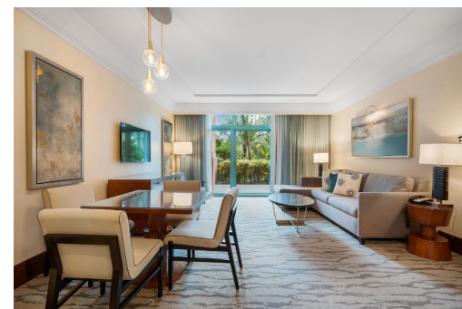
Condo in New Providence/Paradise Island

Unit 1-922 is a tropical lush garden oasis, this one bedroom is comprised of two bath full baths, a washer & dryer, and this unit boasts an extended balcony, the idea for creating fantastic family memories in Paradise. With easy access, It's located on the lobby floor with no need for elevators. The Reef Residences at Atlantis is the only building on the beach at Atlantis that offers full kitchens. The Reef now brags of its newly remodel elegant suites, fully furnished, from linens to tableware and features a wide array of custom interior amenities such as crown molding, granite countertops, and fine European kitchen cabinetry. Owners of The Residence at Atlantis (The Reef) have exclusive access to their own private gym, a Starbucks Cafe conveniently located in the lobby, and an owner's ...read more on our website.