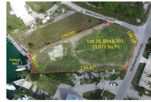
Lots/Acreage in Abaco

Own this rare one-of-a-kind dock lot directly across the street from a 200ft Beach access. Its Ready To Go with an EXISTING 30 ft. lay along dock, an adjoining finger dock with 19K lb. boat lift frame. Build capturing both spectacular Sea of Abaco beach sunrises over the beach greenway & Galleon Bay canal sunsets. This single-family residential lot features an impressive, oversized building parcel of 29,073 s.f. with 55 ft. of bulk-headed canal frontage and a spacious property depth of 236 ft. Strategically positioned is a Greenway Beach Access diagonally across the street offering beaching at your fingertips! This property located adjacent to a non-buildable greenspace offering additional privacy to all the homes in the area. Explore our protected Sea of Abaco, Island hop, shelling, snork...read more on our website.