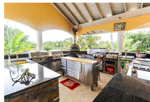
Single Family Home in Grand Bahama/Freeport

Welcome to your piece of paradise! Nestled along the picturesque deep water canal, this stunning home offers a unique blend of luxury and tranquility. Imagine waking up to the gentle sounds of water and breathtaking sunsets and embracing a lifestyle where every day feels like a vacation. This home is perfect for boating enthusiasts and those seeking a peaceful retreat. It boasts four bedrooms and 3.5 bathrooms; every room is crafted for comfort and elegance. The kitchen has modern appliances, ample counter space, and fantastic water views. It is ideal for culinary creations and entertaining guests. Your private powered dock invites you to explore the waterways at your leisure. The possibilities are endless: a morning paddle or an evening boat ride. The backyard is a true oasis, featuring a...read more on our website.