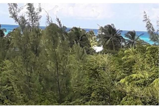
Lots/Acreage in Exuma & Exuma Cays

Exuma Ocean View for Miles! One acre of pristine land boasting panoramic ocean views! This impeccable property is 10 feet above sea level and only a 5 minute walk to sea and only 10 minutes away from the airport, service stations and fine restaurants. Yes, 1 acre of land very near the sea can be yours!...read more on our website.