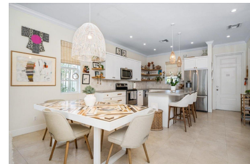
Half Duplex in New Providence/Paradise Island

This Balmoral 2 bed, 2 bath town-home has been recently renovated with an upgraded kitchen, bathrooms and an outdoor covered pergola with a built in BBQ. The unit features a central A/C system with a Nest Thermostat, upgraded plumbing system with a pressure boost pump, additional outdoor storage, and shares a standby generator with the adjacent unit 49. Each bedroom features an en-suite as well as a powder room adjacent to the kitchen....read more on our website.