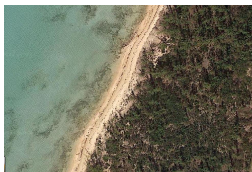
Lots/Acreage in Long Island

Spectacular acreage on the beautiful Caribbean side of Long Island, with 1,200 ft. of white sandy crescent shaped beach stretching for miles. Crystal clear shallow turquoise waters provide excellent anchorage in the sheltered bay for enjoyment of evening sunsets. Lot 4 is less than 100 ft. from the highway and close to a restaurant and bar, medical clinic, grocery stores, hardware stores, liquor stores and service stations, with Cape Santa Maria Beach Resort is only 20 minutes' drive away. The beach is lined with lush green plant life and natural native trees such as natural palms, casuarina, sea grape and many others. As you step into the beautiful water, the sand feels like talc powder, superb for swimming, snorkeling, diving and kayaking. It has a natural reef which protects this amaz...read more on our website.