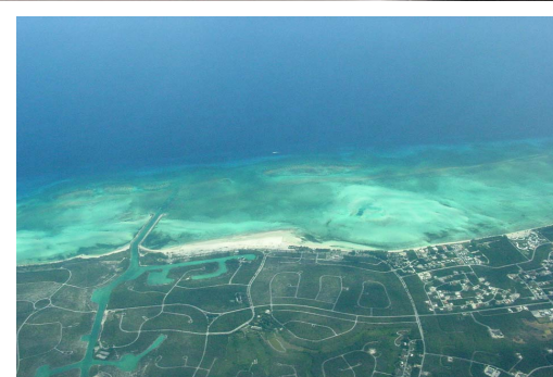
Rare opportunity to own property in the gated community known as The Gardens at Discovery Bay with p

Located in the exclusive gated resort development of Discovery Bay, this magnificent beachfront home-site affords priceless views of the beautiful turquoise waters of Grand Bahama Island.